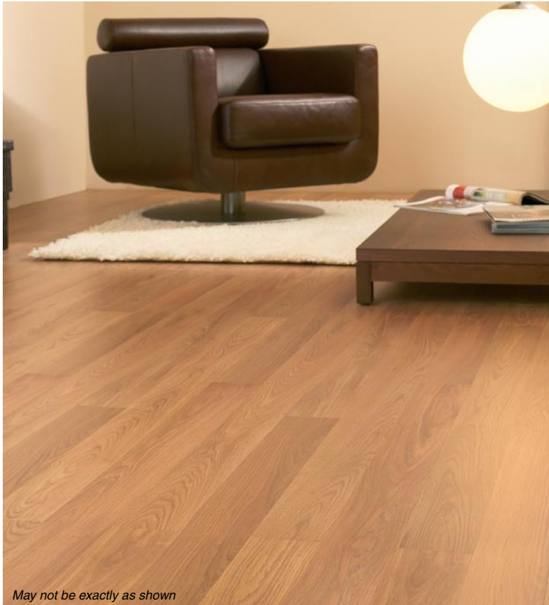
May not be exactly as shown

wood, vinyl, tile, etc. The flooring can vary in thickness, generally between 7mm - 12.3 mm thick. The majority of laminate floors feature a floating installation with a tongue and groove glueless locking system. This type of flooring is typically the least expensive.