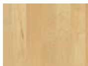
NATURAL BIRCH 222-2115