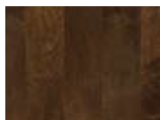
MOCHA BIRCH 222-2100

*5-10% of carton content is comprised of random length boards 12", 24" and 36"