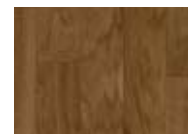
NATURAL WALNUT 222-2125